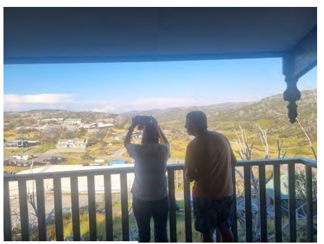
Arrived and settling in.