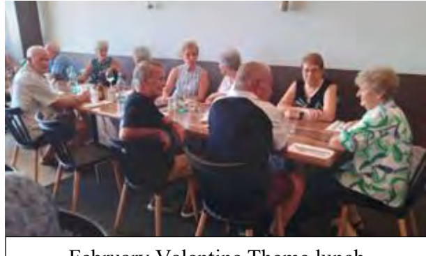
February Valentine Theme lunch