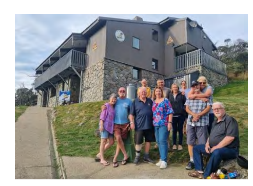
Goodbye 'til next year?