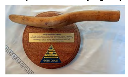
The Trevor Morris Award

The speakers were all judged by acclamation and were declared to be equal winners.